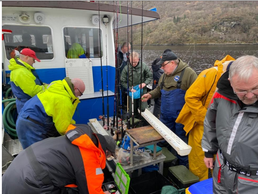
The motley crew – setting up as we head up the loch in search of fish!